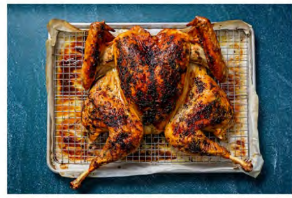
Tarragon-Butter Roasted Spatchcocked Turkey