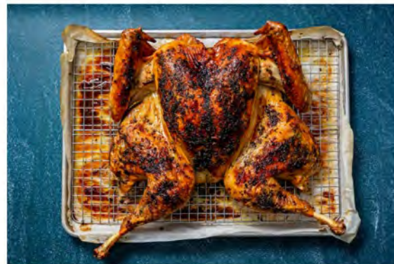
Tarragon-Butter Roasted Spatchcocked Turkey