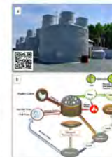
Figure 1. On the right: poultry litter anaerobic digestion system, it uses QR code for ID process control. In Combined AD and nutrient capture system (NCS) process to produce energy and nutrient recovery from poultry litter.

Poultry litter anaerobic digestion challenges: Anaerobic digestion (AD) of poultry litter (PL) is far less common than other substrate, with only seven operational AD systems utilizing PL in the US. The primary barriers for PL digestion are its low moisture content and high total ammonia-nitrogen (TAN) levels. Therefore, successful AD requires the addition of water to the substrate, dry (~30%) substrate content (water prior to AD processing). Following AD treatment, the large volume of liquid, nutrient-rich effluent from the AD process must be field applied to the cropland, from the effluent must be extracted to make the process valuable to the local poultry sector. While current digesters technologies, nutrient recovery have existed for over a decade, there has been relatively few research projects on nutrient recovery from PL due to the industry inaccessibility.