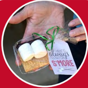
Drive through Camp