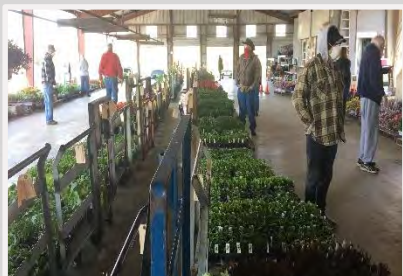
Loveville Produce Auction