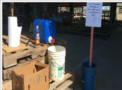
Handwashing stations and signage